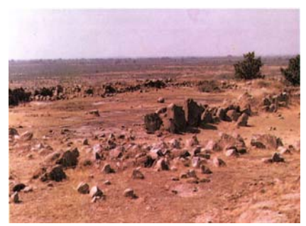
Overgrazing removes complete vegetal cover