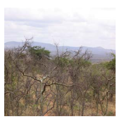
Encroachment by Commiphora species –Borana rangelands Figure 1. Bush encroachment