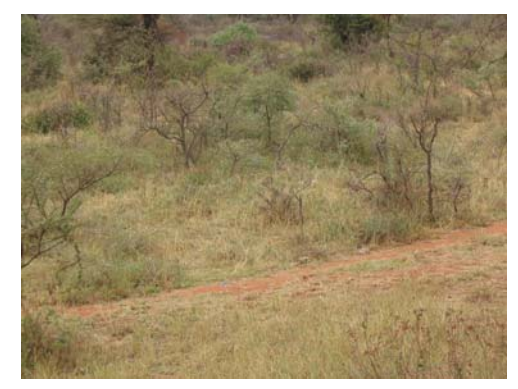
Figure 8. Pasture reserved for dry season grazing (rested)

The success of the range improvement activities can be monitored using the following indicators: