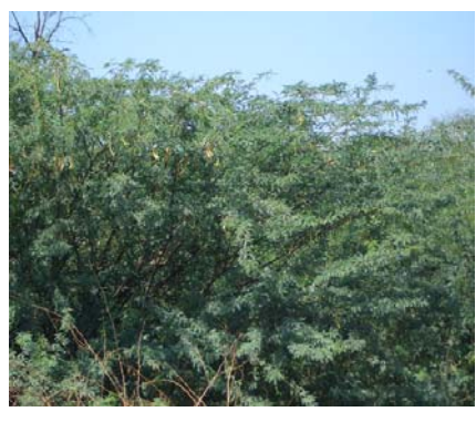
Prosopis juliflora encroachment near Logia, Afar