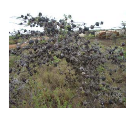
Encroachment with thorny species (Borana rangelands)