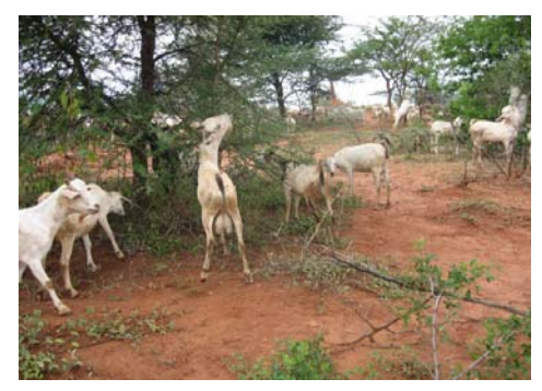
a. Hand clearing of bush b. Use of browsing animals Figure 7. Control of bush encroachment

• Biological control: There are two methods of biological control. The use of browsing animals (camels, goats and game animals) and the introduction of exotic insects which attack specific species of plants. However, the introduction of exotic insects is not recommended to avoid unforeseen consequences. Biological control using browsing animals (Figure 7b) can have a significant effect on bush control if the animal population is commensurate with the available browse vegetation.